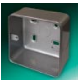
Tough all-round protective coating

Typical of our attention to detail is the new design of the socket insert which further strengthens the moulding for additional protection on accidental impact.