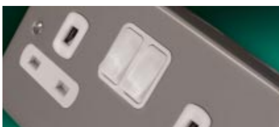
Stylish curved rockers

Insist on Metalclad from DETA when you need rugged reliability with style.