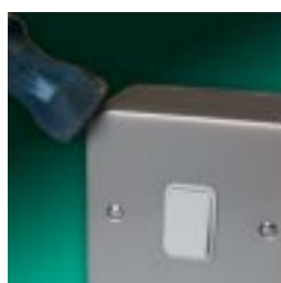
Tough enough to withstand today's knocks and scrapes