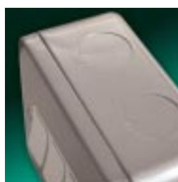
Flush fitting front plates for sleek appearance