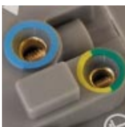
Funnel entry, colour coded terminals

20mm knockouts are provided on all sides and the rear of the back box and are no longer recessed to give a clean flush appearance if there is no need for removal.