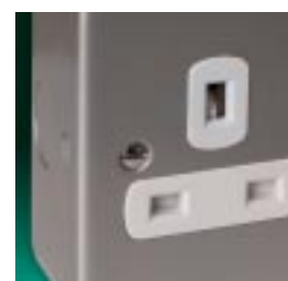
New design socket insert