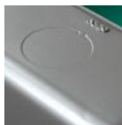
Flush 20mm knockouts on all sides and back