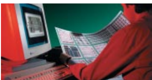
Designed using the latest technology

Every product is supplied with its own back box, except blank plates.