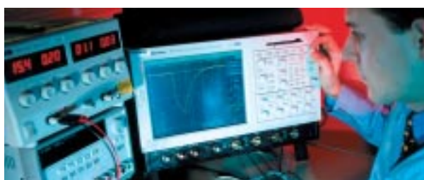
Thorough test procedures