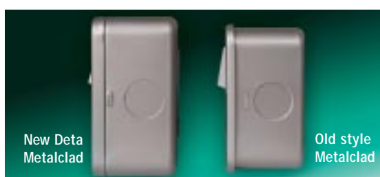
New DETA Metalclad