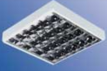
LG3 Category 2 Louvre