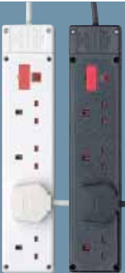
EXL 135 WHI EXL 135 BLK