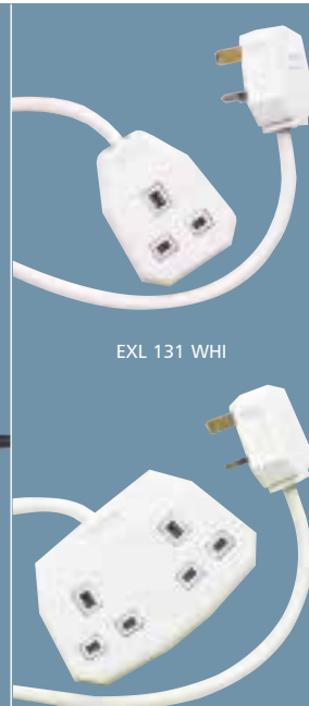
EXL 131 WHI