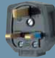
PF 133 BLK