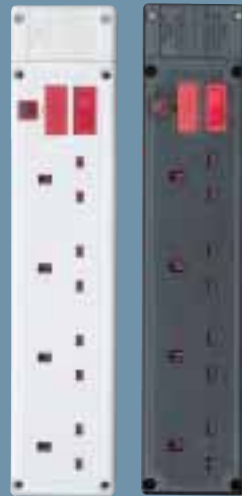
FC 4136 WHI FC 4136 BLK