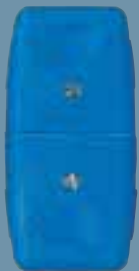
LCP 102 BLU