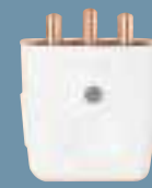
LCP 103P WHI