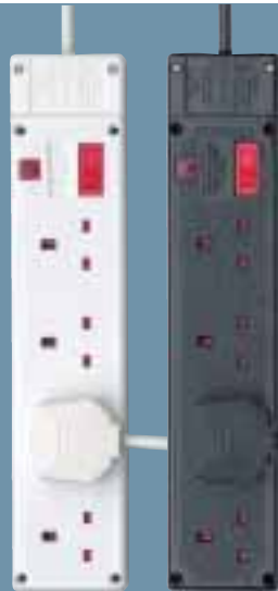
EXL 136 WHI EXL 136 BLK