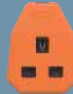
FC 133 ORG