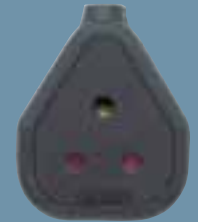
FC 153 BLK

FC 4134 WHI 1 FC 4134 WHI DPK 1 FC 4134 BLK 1 FC 4134 BLK DPK 1 13 AMP WITH FUSE AND NEON