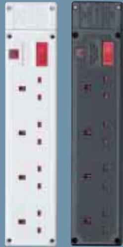
FC 4135 WHI FC 4135 BLK