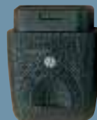
LCP 102S BLK