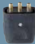
LCP 103P BLK