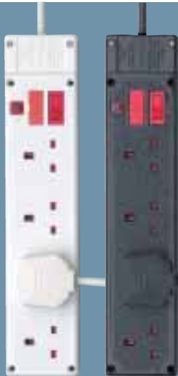
EXL 137 WHI EXL 137 BLK