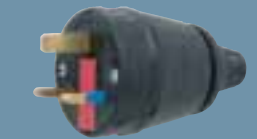
CCP 133 BLK