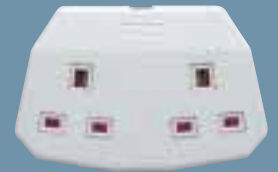
FCT 133 WHI