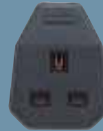
FC 133 BLK