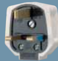
PF 133 WHI