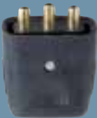
LCP 103 WHI