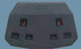
FCT 133 BLK