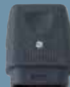
LCP 103S BLK