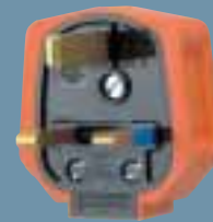
PF 133 ORG