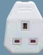
FC 133 WHI