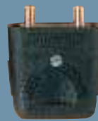
LCP 102P BLK