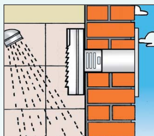
Splashproof fans for areas with high humidity.