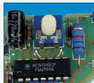
Mini T and Sensor, easy timer adjustment by small control knob.

Mini Sensor, it is extremely simple to install since it is connected to the electrical system with just two wires, thus eliminating the connections that normally need to be made to the light and the light switch.